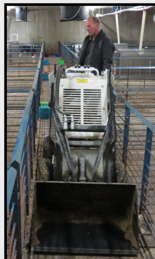
Dan Hazel with Model 550