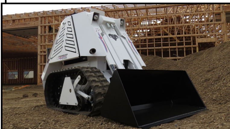
MODEL 1330 AVAILABLE IN 36" AND 42" TOTAL WIDTH CONFIGURATIONS

The short length of all models can help the operator turn on a dime and with opening side panels serviceability is quick and easy.