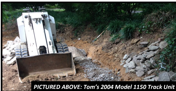
PICTURED ABOVE: Tom's 2004 Model 1150 Track Unit

The compact size of the machine gets into those tight spaces and backyards with barely no footprint left by the machine or disturbance to the surrounding area. Being in the landscaping business Tom has used many different types of mini skid loaders in the past but feels the RAMROD has the most power when it comes to excavating and digging. He has also found the lifting capacity and push pull power to be much larger. Hopson Landscaping is very happy with their machines and RAMROD Equipment is glad to hear it!