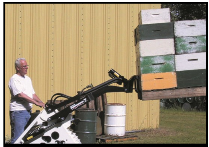
Operator does not have to constantly adjust attachment to maintain a level position during raising and lowering.

Another advantage of the exclusive Self-Leveling feature is it allows a full 85° bucket dump angle. No other competitor even comes close! An 85° dump angle allows you to empty materials easily and efficiently without having to get off the machine. The RAMROD's superior bucket rollback angle of 30° is another feature that allows you to easily fill and carry material in the bucket. You can transport dirt, sand, snow, mulch, etc. with minimum spillage when transporting material in the fully lowered position.