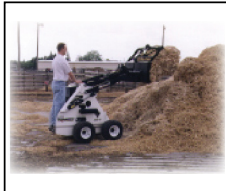
Hay & Manure Fork - 39" Wide with 1 1/4" x 24" Tines