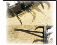
Multi-Purpose Tool-bar Ripper - Tow bar, Boom