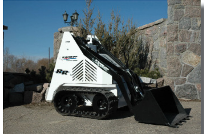
MODEL 575 Track Drive

Two models of RAMROD "Hydraulic Self-Propelled" Mini Loaders deliver big performance in small places. Machines are driver-friendly, with an unobstructed view of all working conditions, with quick-learning time, and equipped with Self-Centering Controls which "Stop Dead" all drive, lift, or levelling movements when the operator's hands are removed from the controls. Machines are easily transported in a trailer or pick-up truck.