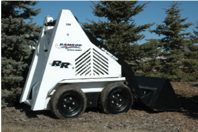
MODEL 500 Four Wheel Drive

Two Great Economical Estate Models To Serve You..