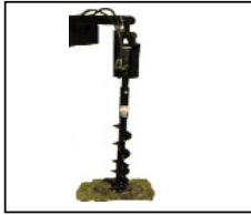
Post Hole Augers