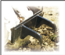
Ripper - with 2 - 12" Long Teeth