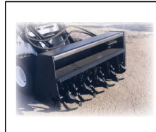
Tiller - 36" Wide - 6" Deep Forward and Reverse Tine Rotation