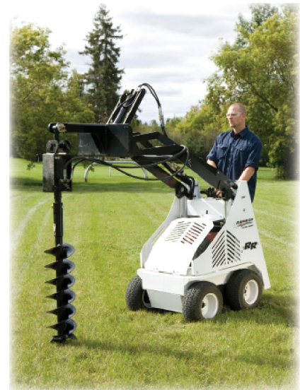
Specifications Subject to Change Without Notice

Stay Ahead With Ramrod - Stay Ahead With The Best