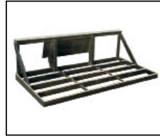
Carry All Leveler - 48" Wide x 24" Deep