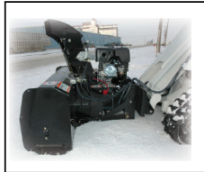
Snow Blower - 35" Wide - 2 Stage - Hydraulic Drive - Adjustable Spout