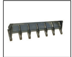
Tooth Bar - For 31", 36" & 42" Buckets

Also 3 in 1 Tool Bar - Slasher/Brush Cutter/ Flail Mower - Call RAMROD for other attachments available