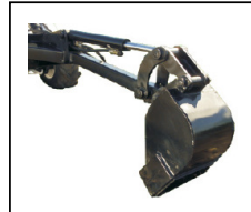
Mini Dipper - 60" Dig, 12" Bucket, 86" Dump Height and 70" Bucket Clearance