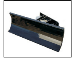
42" Dozer Blade