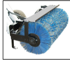
Brooms - 24" Dia x 36" Wide Angles - Steel & Poly Bristles