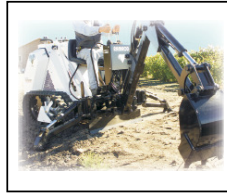
Backhoes - Digs 6'6" with a 9" Reach