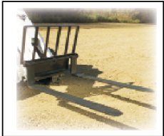
Pallet Lift Fork - Back Guard with 2 - 41" Tines Max 30" Wide