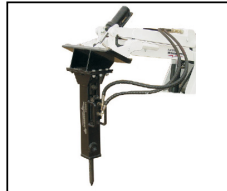
Hydraulic Hammer - 500 to 1300 Blows/minute at up to 184ft/lbs (86gpm)