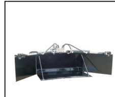
Loose Material Handler - 35" Wide - Opens 68" Hydraulically