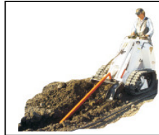
Trencher - 24" Cutting Depth 4" to 6" Chain Widths