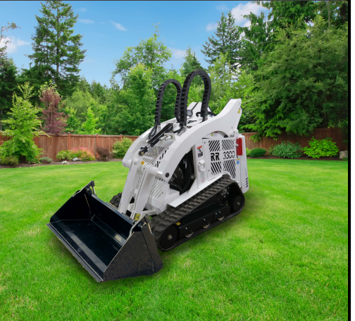
INQUIRE TODAY ON NEW MODELS !!!